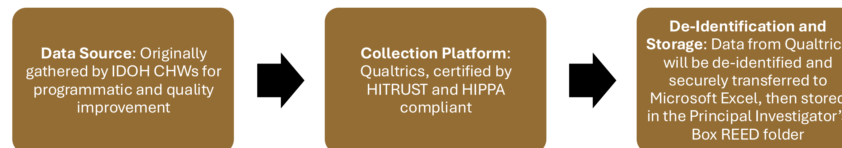
Fig 3. Data Collection & Management